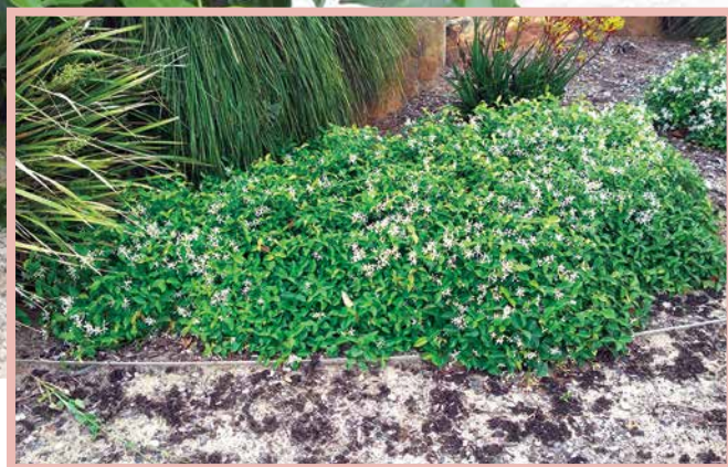
These plants are the same age. Notice the faster prostrate growth of Flat Mat™ Trachelospermum (left) compared to the common form (right).